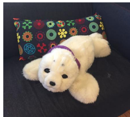
Figure 1: Paro: a socially assistive, seal-like robot.